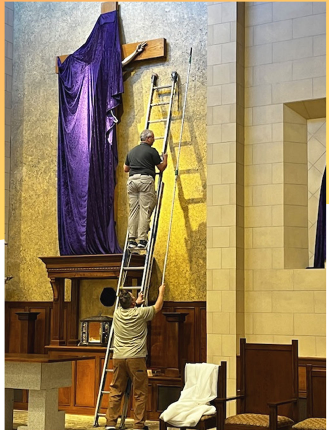
Preparing for The Great Vigil